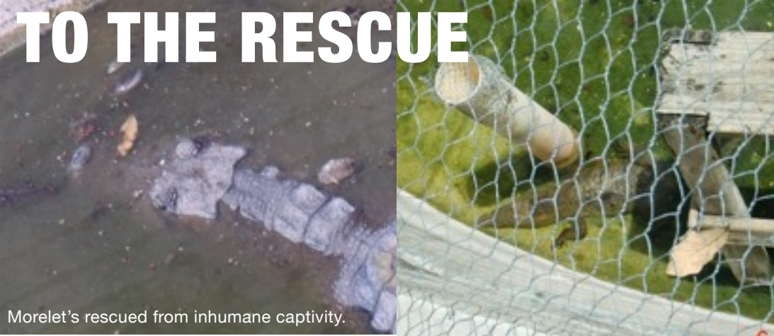
Morelet's rescued from inhumane captivity.