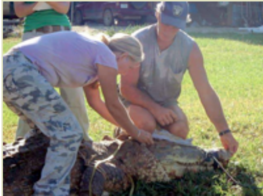
Collected scientific data provides essential information about population distributions of American crocodiles in the region. Since very little is known concerning the American Crocodile’s status and hatchling viability in Belize outside of Turneffe Atoll, the information provided by ACES will be vital to effective conservation methods for Belize.

Added projects would include assisting low-income housing areas with filling under their homes to prevent crocodiles from inhabiting these areas, which is a common problem on the island; and the construction of a small educational croc refuge and visitor center with displays.