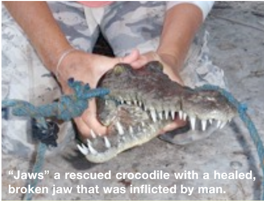
“Jaws” a rescued crocodile with a healed, broken jaw that was inflicted by man.

Generally, people fear what they do not understand. It is imperative to first educate the local people and children about crocodiles to raise awareness concerning the importance and value of American crocodiles in Belize’s highly diverse ecosystems.