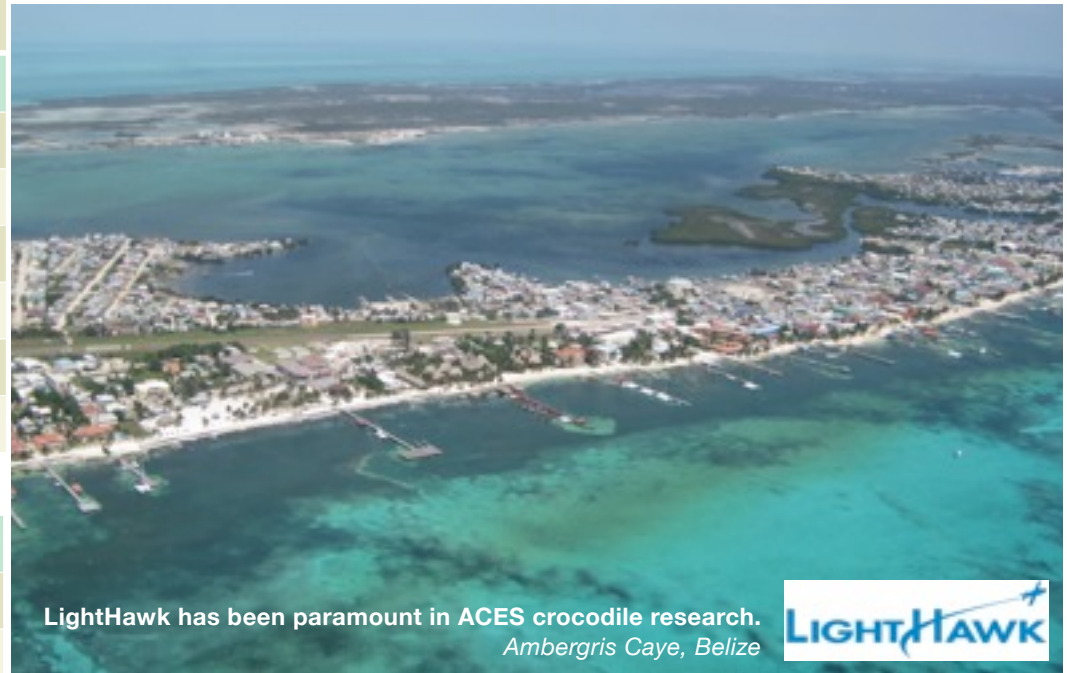
LightHawk has been paramount in ACES crocodile research. Ambergris Caye, Belize

A broader impact resulting from this project is an increase in public awareness about crocodile conservation. Working closely with communities during data collection will present the opportunity to educate the local populace on the importance of crocodiles in Belize's ecosystems and how to safely coexist with them; thus expectantly, reducing croc-human conflicts and nonsensical crocodile killings in Belize.